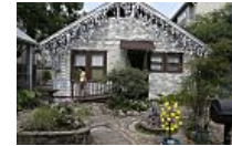
Houston's beer can house