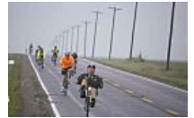
RAGBRAI 2013 on Friday: Oskaloosa to