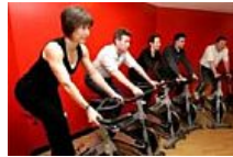
This 1 Exercise Accelerates Aging In ... Old School New Body