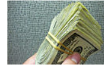
Do You Need $100,000 to Make a Living With... The Life Wiki