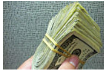
Do You Need $100,000 to Make a Living With... The Life Wiki